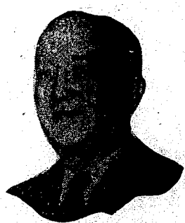
WILLIAM Z. FOSTER

The President of the United States, radio commentators, editorial writers, Congressmen and lesser fry have all joined the chorus of adverse comment on a recent statement issued by American Communist leaders on the peril of war.