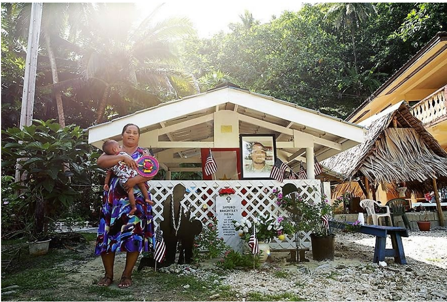
Island Soldier , a documentary that follows

members from a family living in the Federated States of Micronesia to military training and then to the battlefields of Afghanistan, will be shown for free on the UH West O'ahu campus.