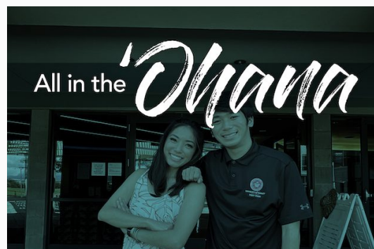
UH West O'ahu has positive impact on siblings