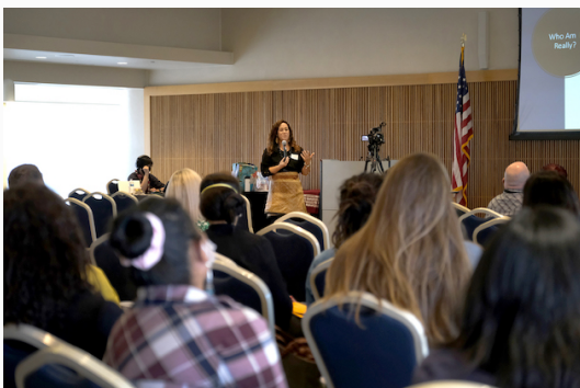
Research conference celebrates faculty work and