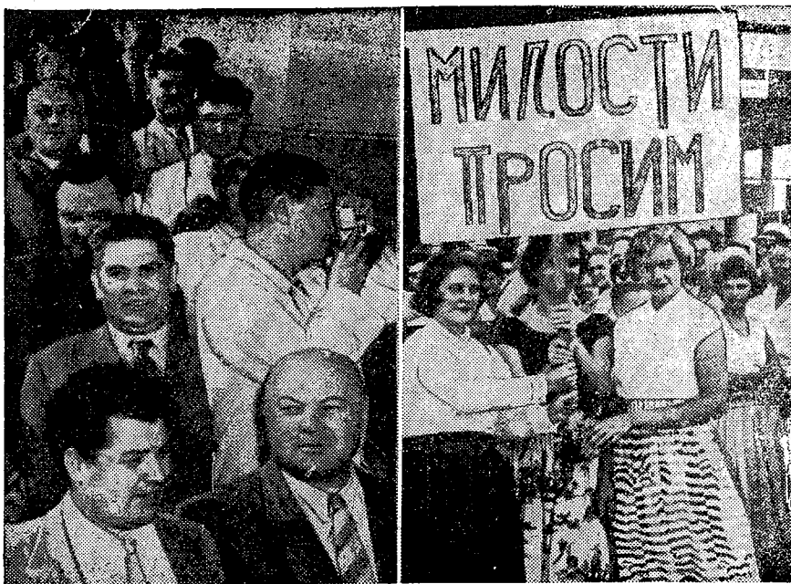
SOVIET FARMERS GET IOWA WELCOME —Farm experts from Russia (left) leave their plane in Des Moines, the first stop in their tour of American agricultural centers.

They are studying US production methods. They were greeted by a group of girls (right) carrying a sign printed in Russian, which, translated, said: "Welcome!"