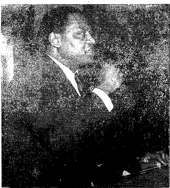
The Artist Addressing a Gathering