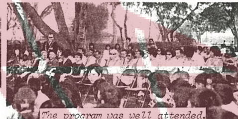
The program was well attended.

To the tune of "To You a Lei", sung by a member of the Royal Hawaiian Band, Ewa School students draped colorful leis over the school's bronze statue of Abraham Lincoln, an impressive and moving climax to Ewa School's 26th annual Lincoln Day program held Wednesday, February 12th.