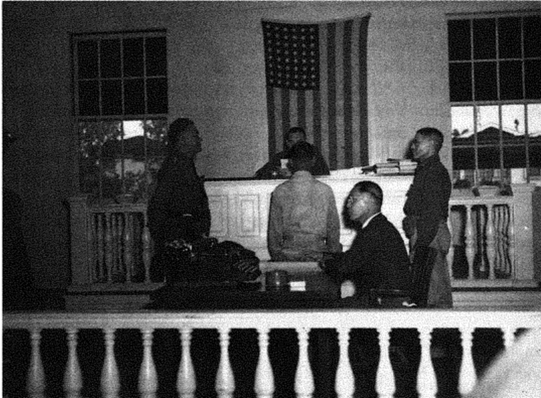
2 The Wahiawa District Court served as a provost court during the period of martial law.