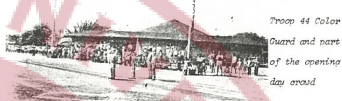
Troop 44 Color Guard and part of the opening day crowd