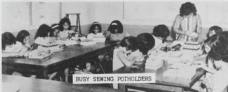
BUSY SEWING POTHOLDERS