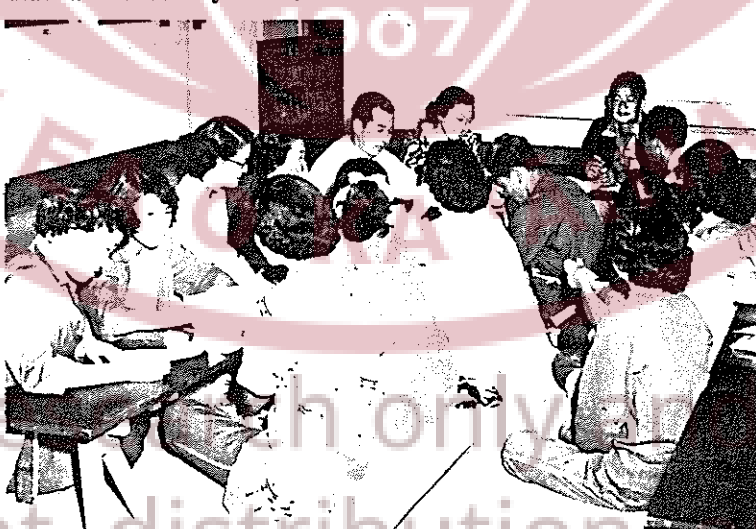
At informal meetings, the Soto Y.B.A. group plans its activities. Here they're talking over a camping trip. Their program includes many outings and meetings for prayer and religious study.