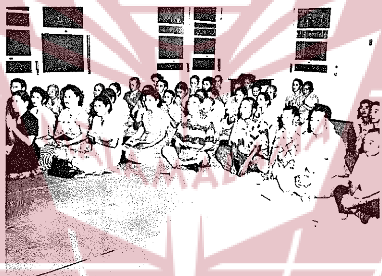
Members of the Kyodan (congregation) attend a service of prayers and sermon. They are very proud of their church building. Funds were raised within the church group and construction was done with voluntary labor.