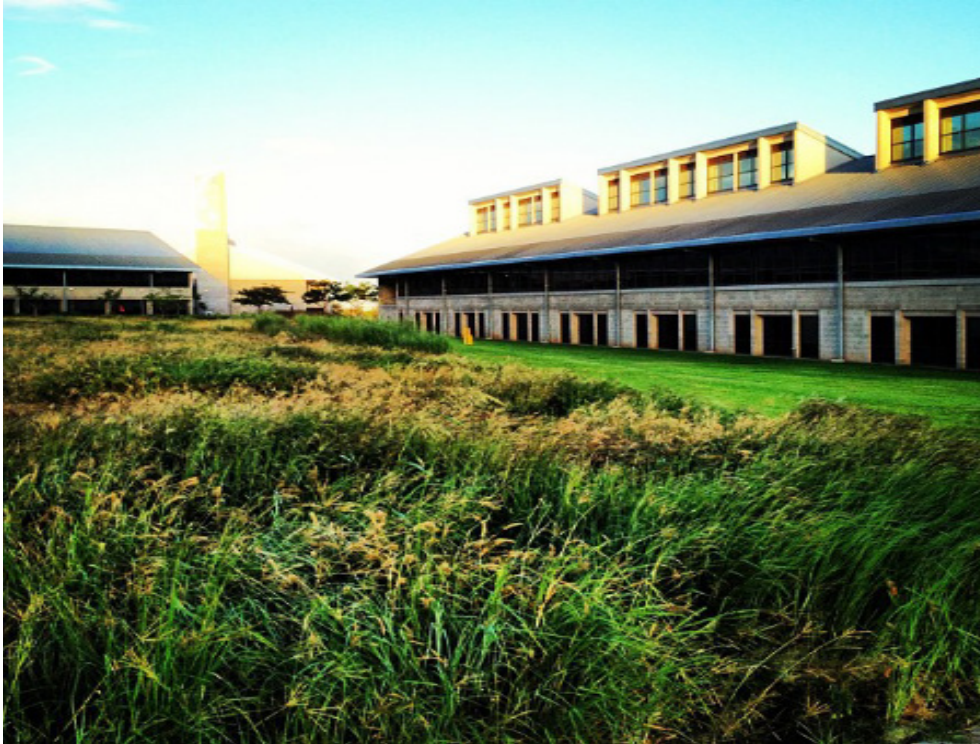
Jonny Huynh @jonnytsunami402

Students use Instagram to capture campus life at #UHWO. Follow us @thehootpress and follow your peers!