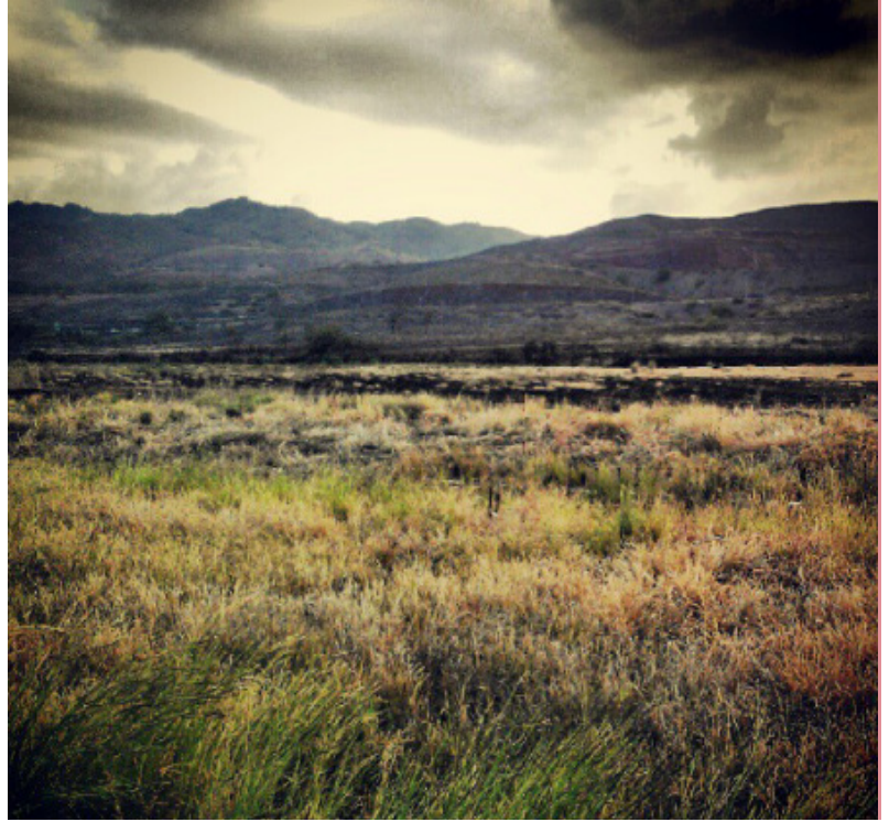
Fritzel Gallego @behappyalways23