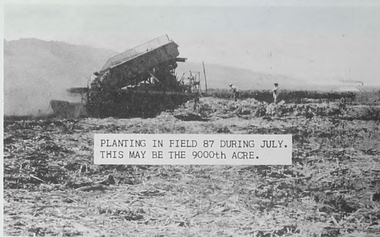
PLANTING IN FIELD 87 DURING JULY. THIS MAY BE THE 9000th ACRE.