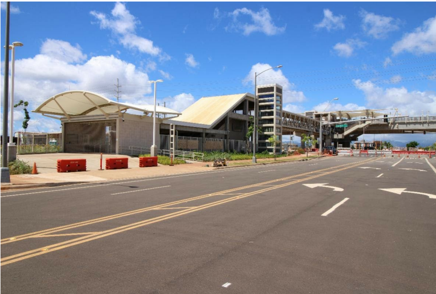
A recent photo of Keone'ae (UH West O'ahu) rail station.