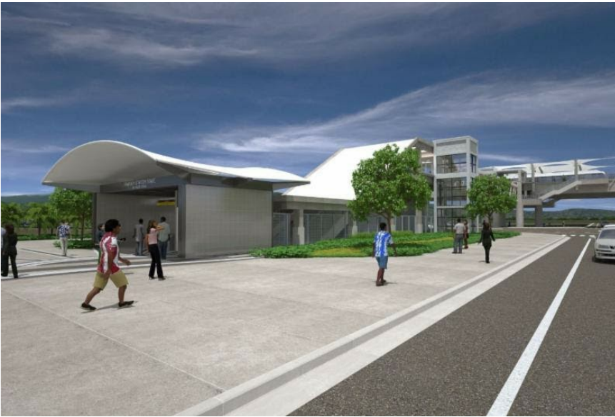
An artist's rendition of Keone'ae (UH West O'ahu) rail station.