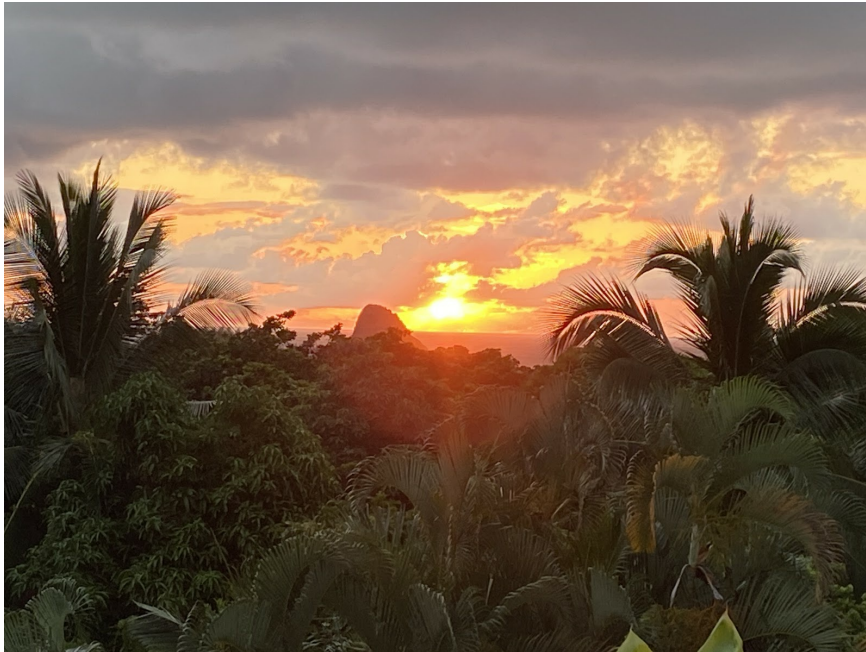
Windward morning sunrise.

I love when I get to catch the sun rise. The start of something beautiful, the day. The start of the beginning, the unknown. To catch the sunrise, I am still and I listen. I hear the birds sing, I reach for your hand. I feel the morning air, I know I am able. To catch the sunrise, I am still and I listen. I see the mountains, I accept possibilities. To catch the sunrise, I am still and I listen.