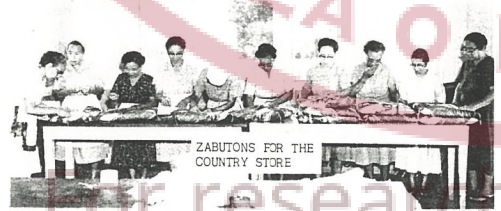
ZABUTONS FOR THE COUNTRY STORE