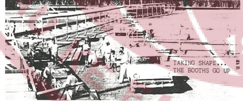
TAKING SHAPE... THE BOOTHS GO UP

The Commercial and Industrial Exhibits section promises to eclipse all previous shows in grandeur. Our 50 business firms have spoken for display spaces—a record breaker, indeed!