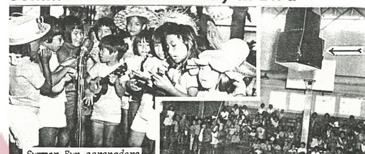
Summer Fun serenaders