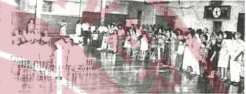
Family and friends share the first of many "graduations" with the younger generation.