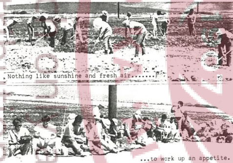
Nothing like sunshine and fresh air.....

Presently, 23 young men have been hired.