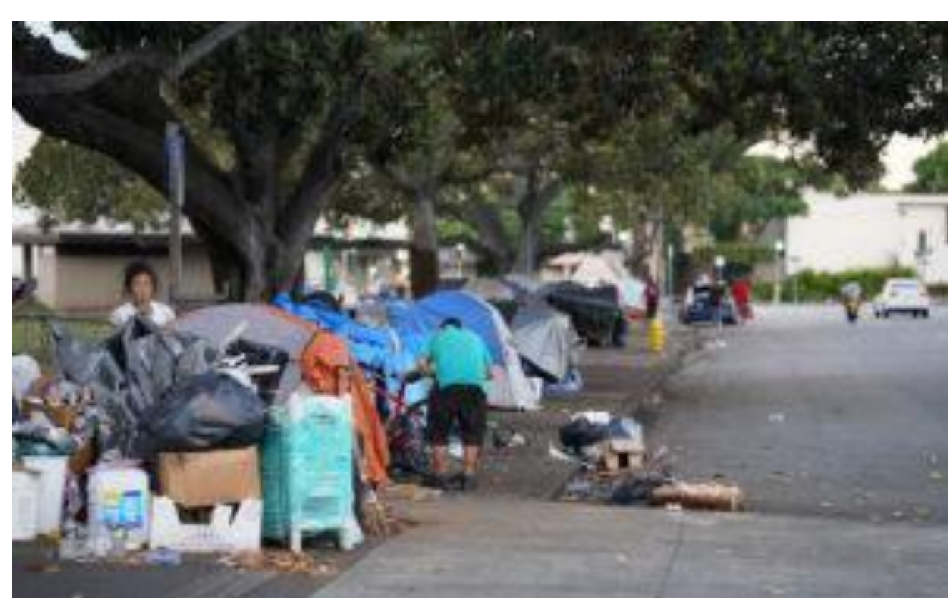
Figure 1: Homeless on Oahu, Hawaii

Mental health issues, substance abuse, and Hawaii's high cost of living are the main factors that contribute to homelessness in Hawai'i.