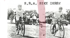
E.R.A. BIKE DERBY