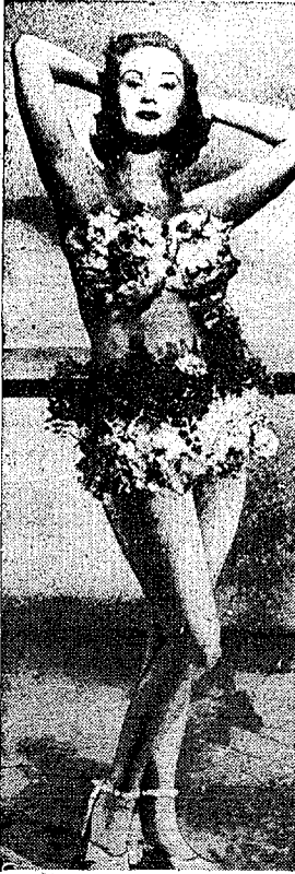
Choice of 15,000 florists as standard-bearer for National Flower Week is film star Virginia Mayo, who obligingly blossoms out for flower fans.

You see, it wasn't a fight, exactly. It was a "bulldup." And "bulldups" always end conveniently according to the promoter's needs.