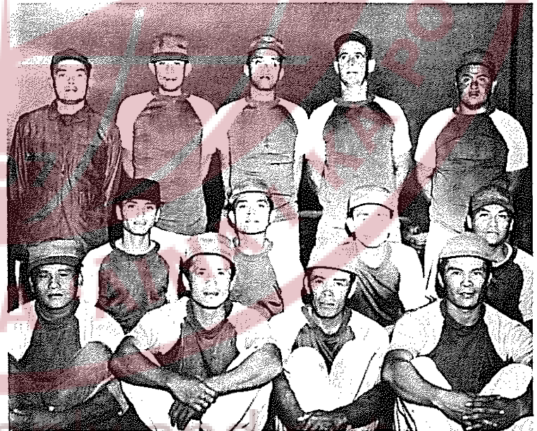
1955 E.R.A. INTER-CLUB SOFTBALL LEAGUE CHAMPIONS....Filipino Social Club dethroned the last year's champs, Ewa Beach, by taking two straight game in the best of two-out-of-three series for the softball league crown last week. F.S.C. won the first game 7 to 4 and the second game 4 to 2. Both of these teams completed the regular league play with 8-1 record.