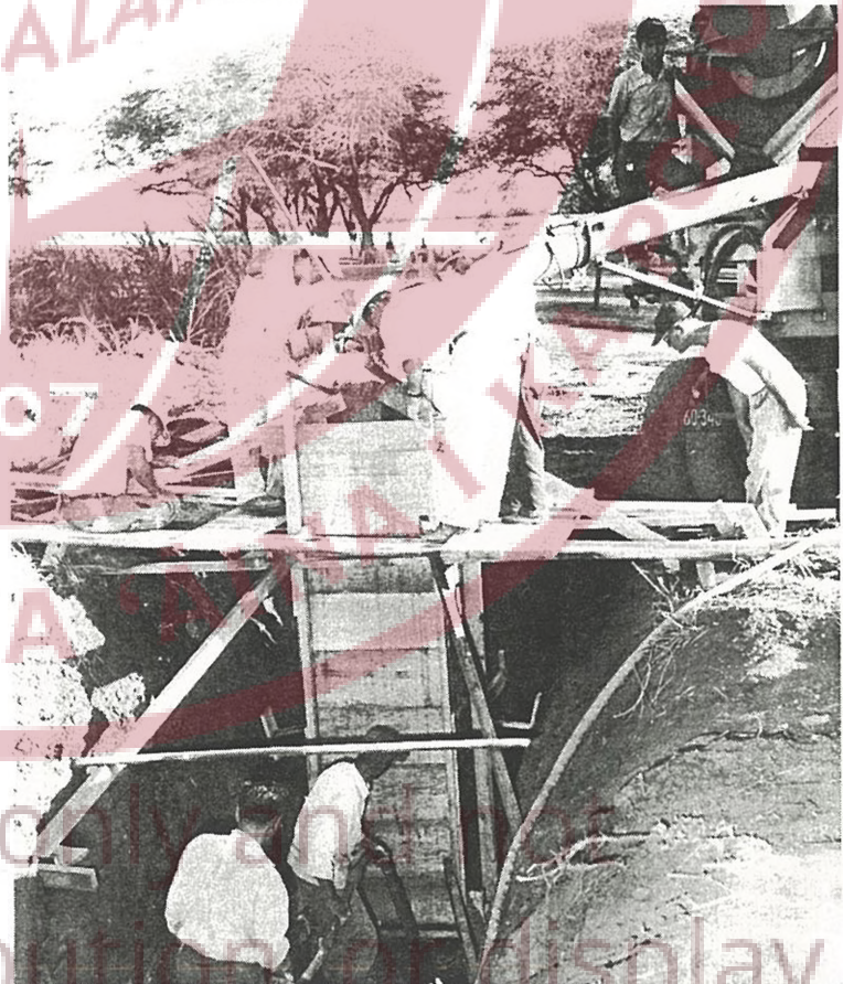
A siphon is built by Ewa's construction crew to go under the new entrance road to Fernandez Village. The siphon will supply water to the portion of Field 56 across from Oka's service station. The project is under the supervision of Goichi Kazunaga.