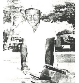
which won the Jr. A.J.A. championship in 1938.