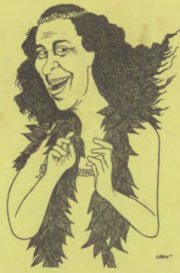
HULA DANCER IOLANI LUAHINE