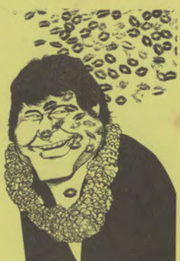
ENTERTAINER DON HO