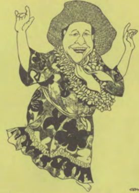
ENTERTAINER HILO HATTIE