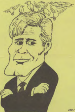
ACTOR JACK LORD