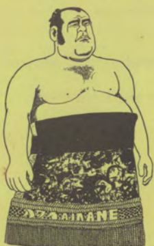
SUMOTORI JESSE KUHAULUA (TAKAMIYAMA)