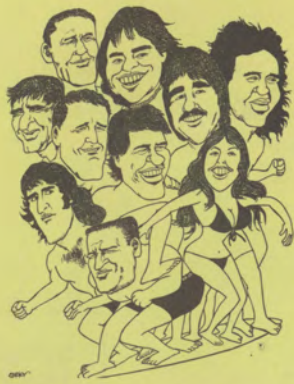
HAWAII'S TOP SURFERS