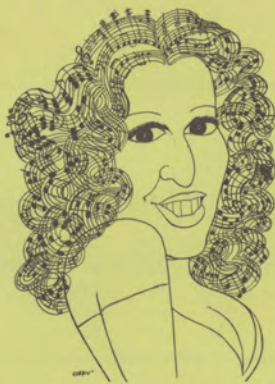
ENTERTAINER BETTE MIDDLEL