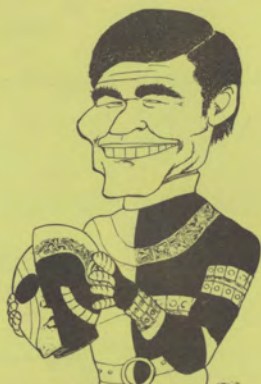
GOVERNOR GEORGE ARIYOSHI