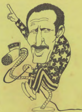
TOP DISC JOCKEY AKU