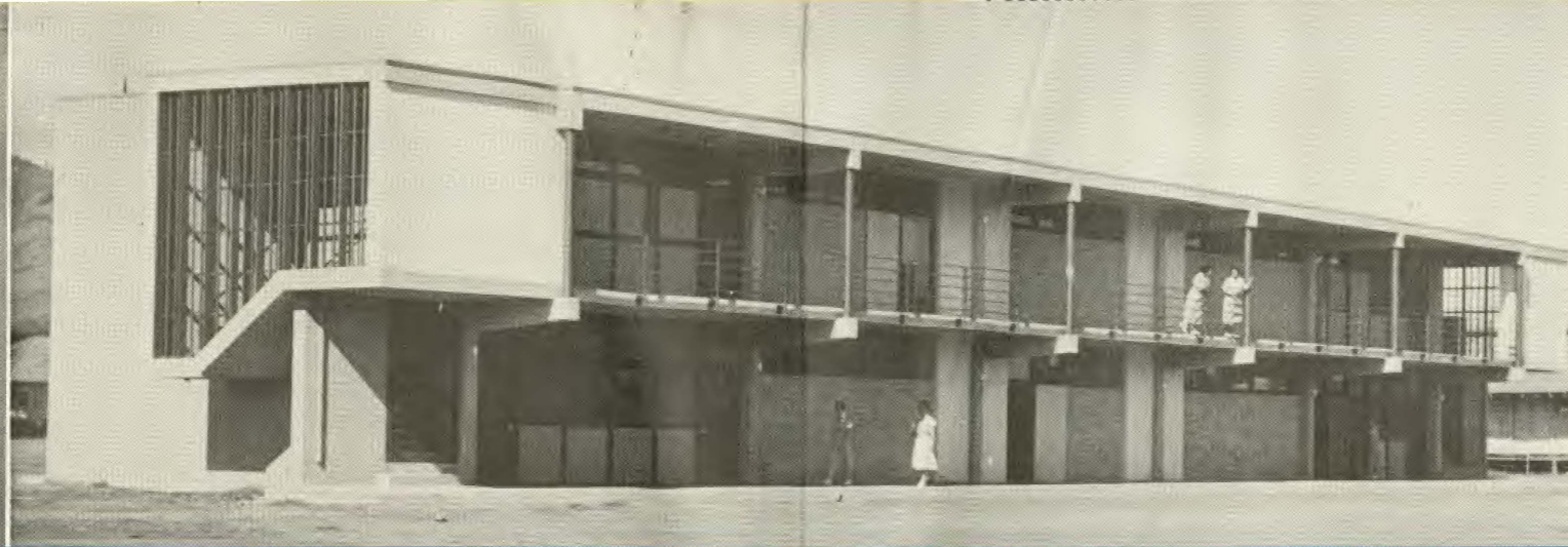
Practical Nursing Department Building