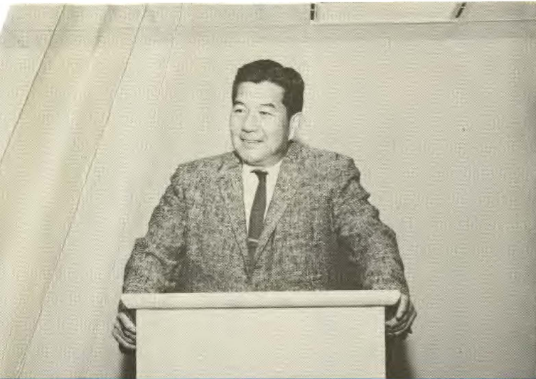
The Principal Speaks