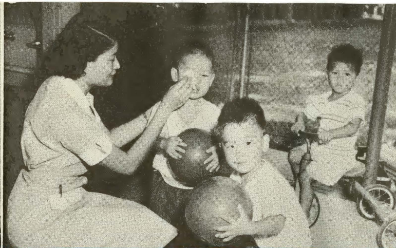
Care of the Well Child