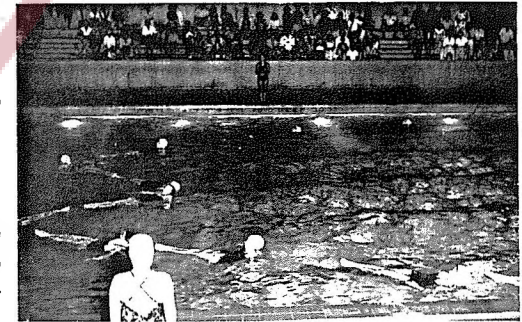
For the finale of the show, these young aqua belles from the YWCA synchronized swimming class and the Ehu Kai synchronized swimming club salute Ewa by spelling the letters E-W-A in the water.