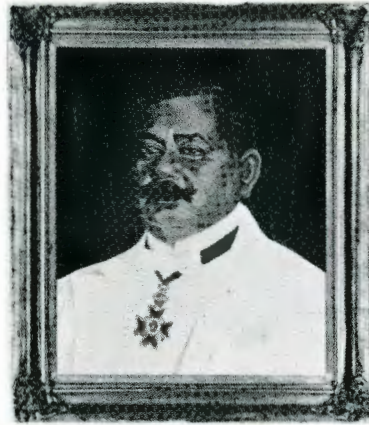
PRINCE JONAH KUHIO KALANIANAOLE (1871-1922)

Prince Kuhio was the great-grandson of King Kaumualii, last reigning monarch of Kauai. He was the second son of High Chief David Kahalepouli Piikoi and Princess Kinoike Kekaulike. He had an older brother David Kawanakoa, and a younger brother Keliiahonui, who died in childhood.