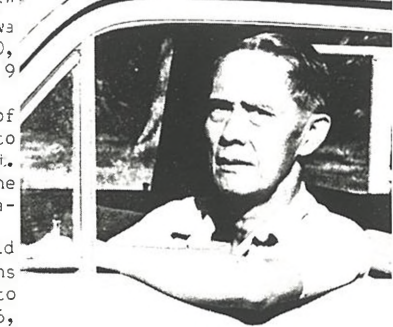
F P C O