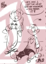
HEY, MAC! LOSE THE HEAD OFF MY HAMMER - YOU SEEN IT?

WRENCHES should be of the right type and size to fit snugly. Never hammer on the handle of the wrench or use a pipe for more leverage.