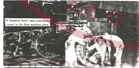
A disabled Army tank undergoing repair in the Ewa machine shop.

It is a pleasure to commend you for the fine showing Ewa workers made during the December 7 attack. There were many instances of individual heroism and devotion to duty. Your spirit of neighborliness toward members of the armed forces stationed in the Ewa area has been a subject for much favorable comment and has set a fine example."