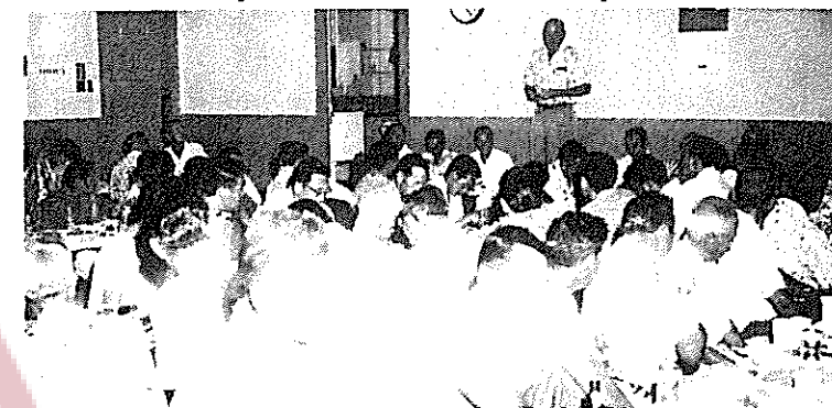
Senior and Junior ball players of Ewa's teams were honored at a banquet sponsored by the Ewa Japanese Athletic Club last Saturday evening at the Japanese Social Hall. About 130 backers, ball players and guests attended the banquet.