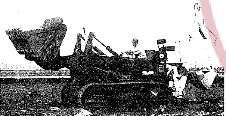
This new equipment called the Payloader-Back Hoe tractor was recently purchased from the Hawaiian Equipment Company. This multi-purpose tractor does digging, scraping, grading, loading, etc. and will primarily be used in the Preparation Division. It may be used on other jobs outside of Preparation Division as needed.