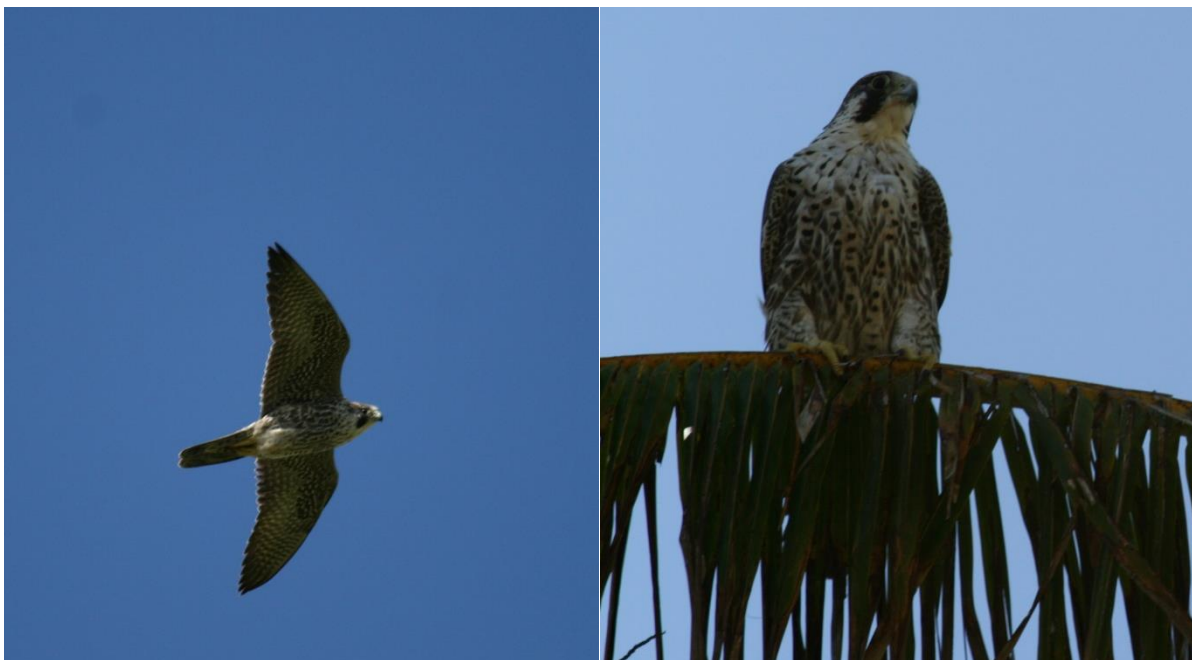
Figure 5. Peregrine falcon ( Falco peregrinus ) observed at Laysan Island, Hawai‘i, January–April 2009.