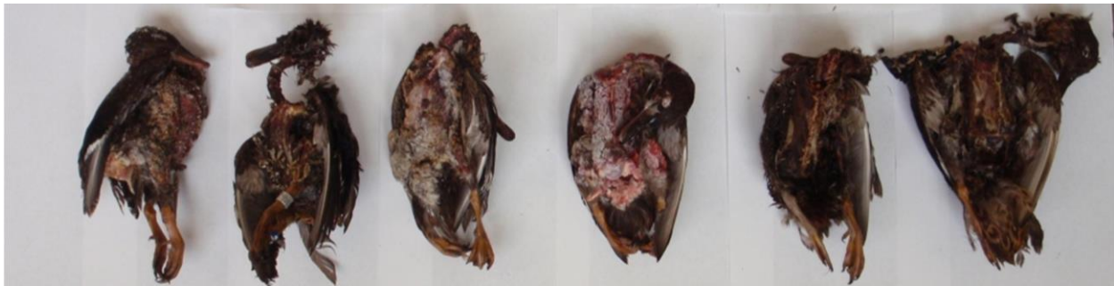
Figure 4. Six Laysan teal ( Anas laysanensis ) carcasses recovered at Sand Island, Midway Atoll, Hawai'i, that had been depredated by a Peregrine falcon ( Falco peregrinus ), October–November 2008. Denudation of neck and pectoral tissues along with keel notching are consistent with Peregrine falcon predation.

HY = hatch year; (A)SY = (after) second year; UNK = unknown