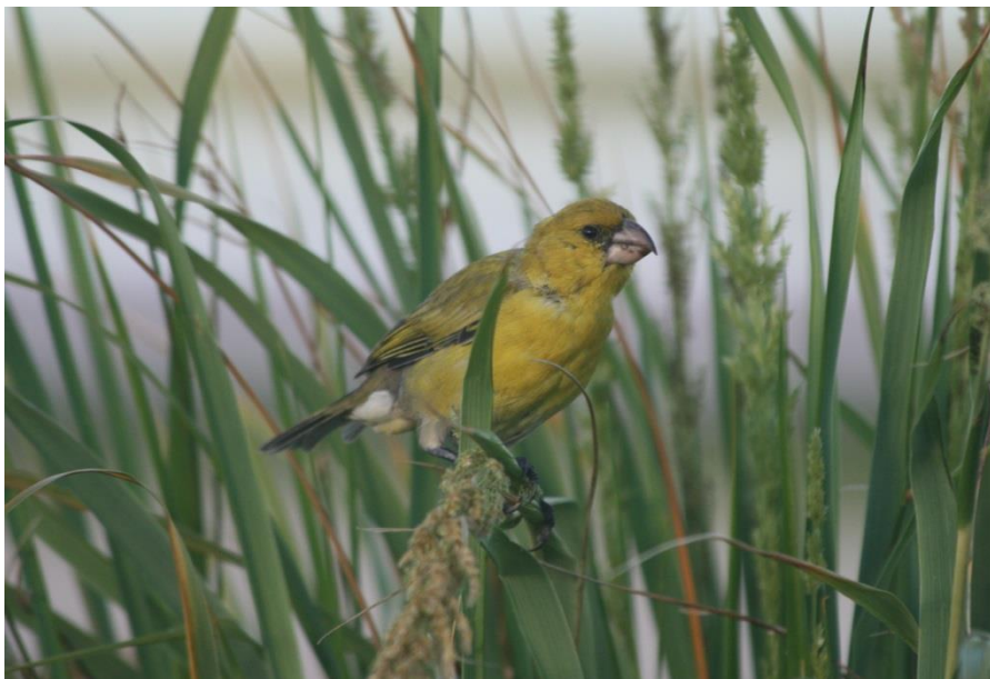
Figure 2. Laysan finch ( Telespiza cantans ) at Laysan Island, Northwestern Hawaiian Islands.

their carrying capacity of 434 \pm 72 and 10,580 \pm 3,513 birds, respectively (Morin and Conant 2002, Seavy et al. 2009, Berkowitz et al. 2012). Anthropogenic disturbances causing extirpation of Laysan teal included multiple shipwrecks to Lisianski Island and subsequent invasions of mice ( Mus musculus ) during the mid-1800s (Olson and Ziegler 1995). In 1903 introduced rabbits