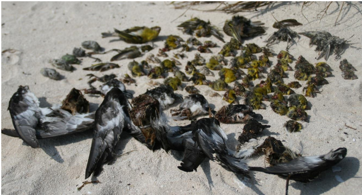
Figure 6. Bird remains collected from Peregrine falcon ( Falco peregrinus ) roosts at Laysan Island, Hawai'i, January–April 2009. From remains recovered at perches and direct observations of predation events, six species (Bonin petrel, Tristram's storm-petrel, Brown noddy, Laysan finch, Ruddy turnstone, and Pacific golden plover) were identified as Peregrine falcon prey at Laysan Island.