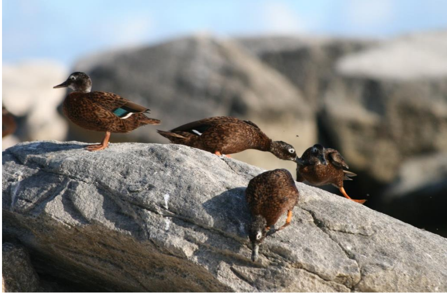
Figure 1. Laysan teal ( Anas laysanensis ) at Laysan Island, Northwestern Hawaiian Islands.