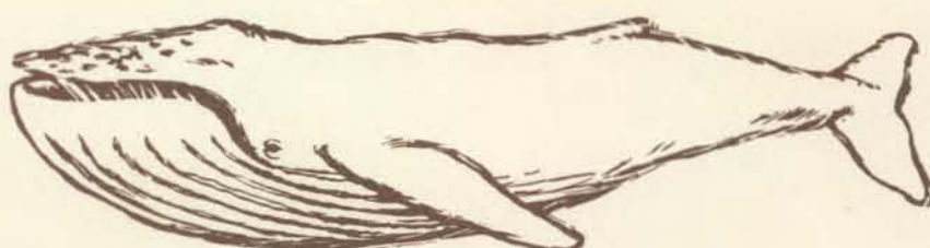
North Pacific Humpback