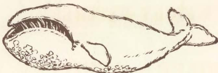
Pacific Right Whale