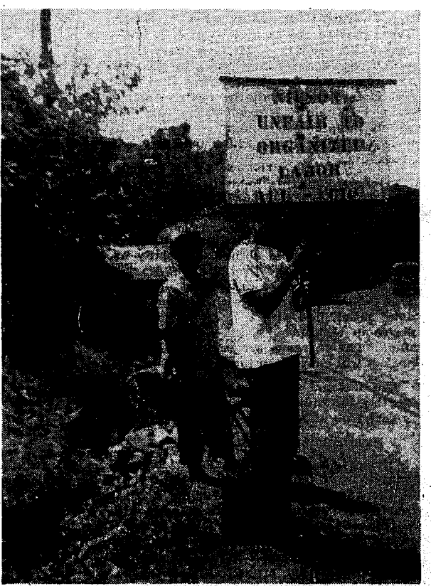
THE STRIKE ON KAUAI by workers in the construction industry to get recognition for the Carpenters Union AFL-CIO goes on. Here a picket shows the sign he carries. Contractors who have refused to recognize the union have a hard time finding anyone to help finish projects they have started and some work only on weekends. Union officials say they are considering filing a complaint of unfair practices with the NLRB. Their target, if such a complaint is filed, may be the Hawaii Employers Council, which they say is carrying the ball for the reluctant contractors.

"Actually, there's more than the Senator of Oriental birth that objection to sitting alongside a raises the hackles on Southern