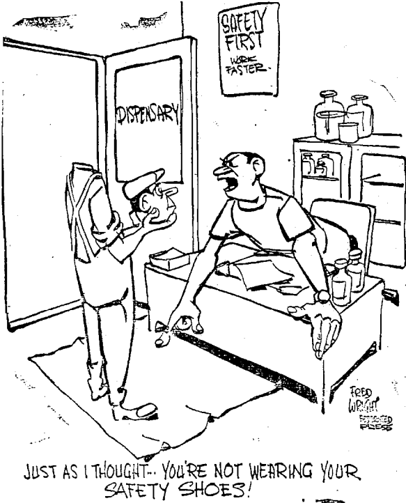
JUST AS I THOUGHT... YOU'RE NOT WEARING YOUR SAFETY SHOES!