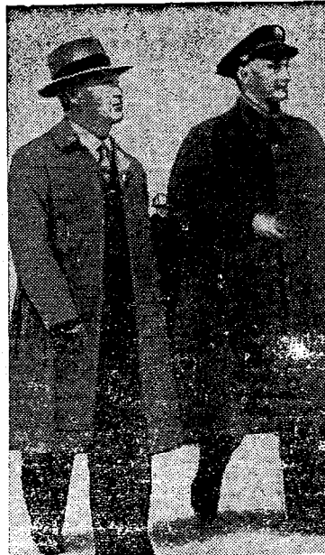
Chiang Kai-shek and Syngman Rhee hope for war, U. S. aid to keep regimes.

If the rival imperialisms get at each other's throats, it is already evident that Malenkov will be blamed for failing to separate them. After all, Marx and Lenin, and also Stalin a year ago, said that's what the capitalist powers would be doing.