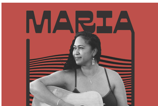
UH West O'ahu music event features special guests