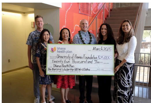
UH West O'ahu pre-nursing program receives $25K gift