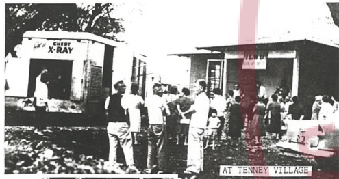
AT TENNEY VILLAGE