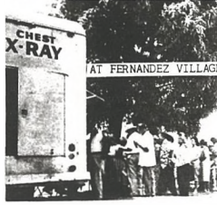
AT FERNANDEZ VILLAGE